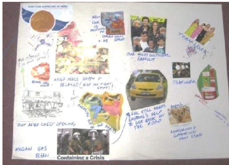
Figure 3. Example of group creative evaluation of workplace culture 'then and now'

Below, the CTICU NUM has captured her journey, reflecting and sharing how she felt throughout the stages of the facilitated work in this critical care area.